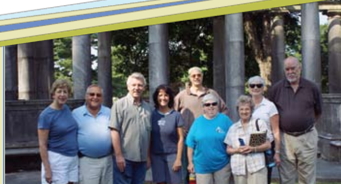
Kingston Walks participants gathered together for the 2009 Montrepose Cemetery saunter.

The Grand Walkabout of the Hudson Valley • Physical Medicine & Rehabilitation Department – Benedictine/Kingston Hospital • Montrepose Cemetery Board of Directors • Emblem Health • Benedictine Walking Club • Forsythe Nature Center The Junior League of Kingston • YMCA • Friends of Historic Kingston • American Heart Association • Gateway Community Industries • American Cancer Society